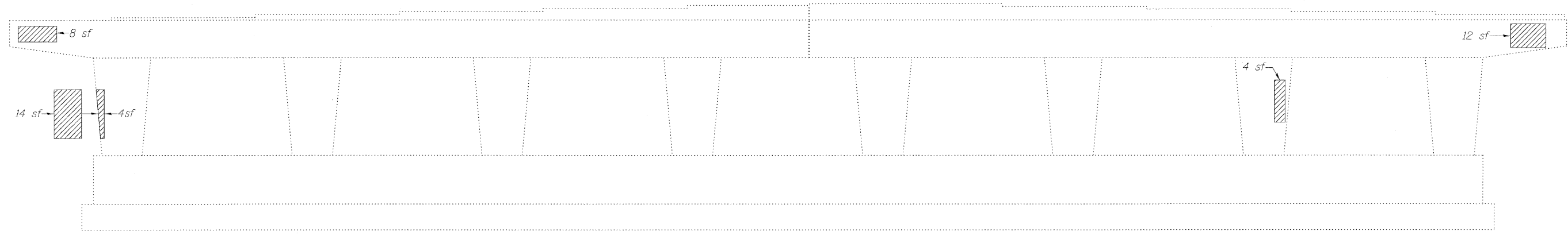
PIER 1 (Looking North)