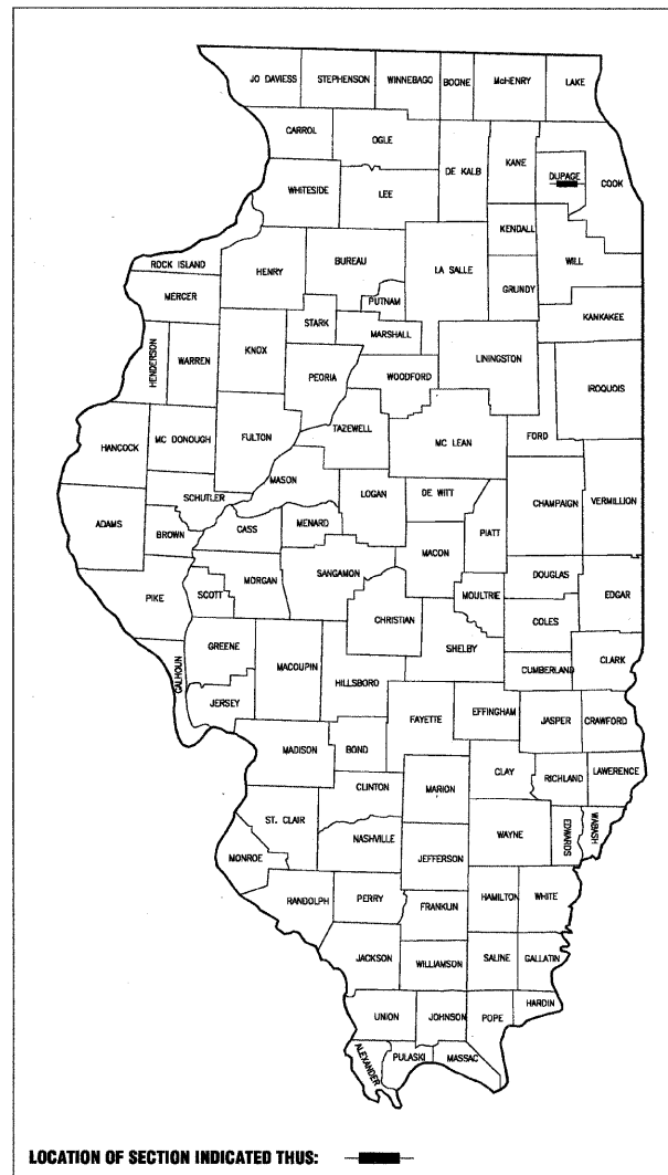
LOCATION OF SECTION INDICATED THUS: [Symbol]

STATE OF ILLINOIS DEPARTMENT OF TRANSPORTATION DIVISION OF HIGHWAYS