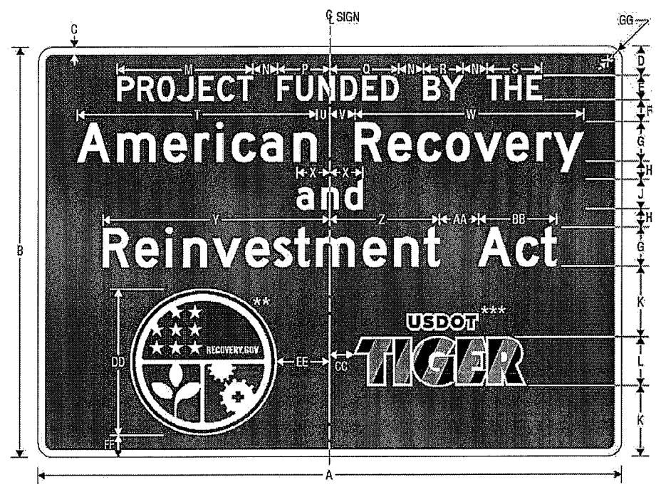
PROJECT FUNDING SOURCE SIGN

NOTE: SIGN SHALL NOT BE INSTALLED WITHOUT PROJECT FUNDING SOURCE PLAQUE