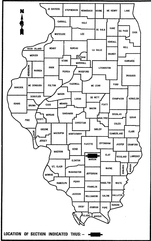
LOCATION OF SECTION INDICATED THIS: - [black rectangle]