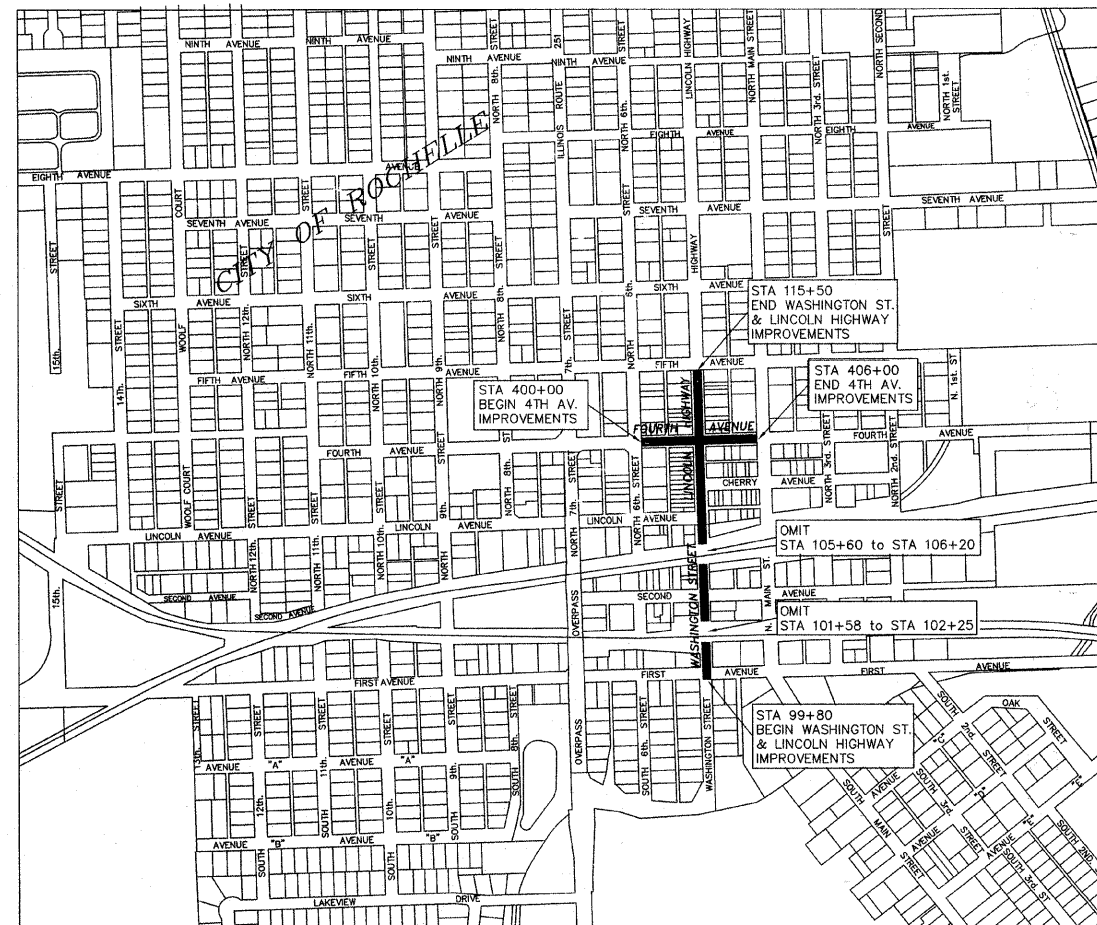
Location Map Not to Scale

Gross Length of Improvements = 2164 Feet or 0.41 Miles Net Length of Improvements = 2059 Feet or 0.39 Miles