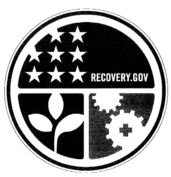
RECOVERY Vector-Based, Vinyl-Ready Pictograph