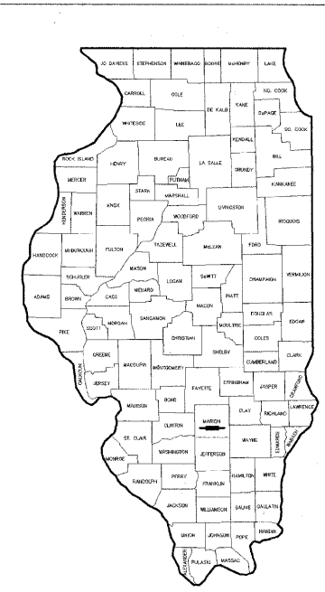
LOCATION OF PROJECT INDICATED THUS -