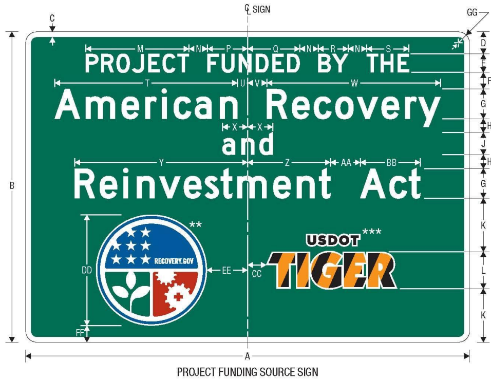
PROJECT FUNDING SOURCE SIGN

NOTE: SIGN SHALL NOT BE INSTALLED WITHOUT PROJECT FUNDING SOURCE PLAQUE