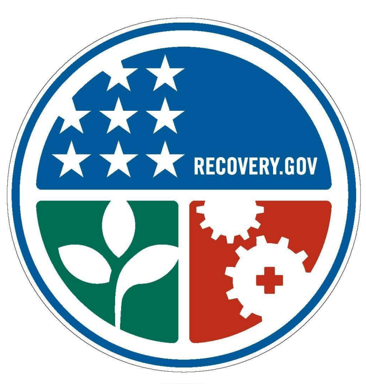
RECOVERY Vector-Based, Vinyl-Ready Pictograph

COLORS: LEGEND, OUTLINE — WHITE (RETROREFLECTIVE) BORDER — BLUE (RETROREFLECTIVE) BACKGROUND (UPPER) — BLUE (RETROREFLECTIVE) BACKGROUND (LOWER PIGHT) — BED (RETROREFLECTIVE)