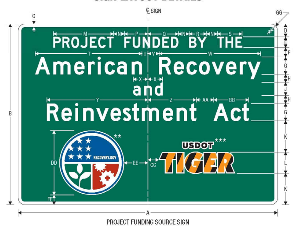
NOTE: SIGN SHALL NOT BE INSTALLED WITHOUT PROJECT FUNDING SOURCE PLAQUE