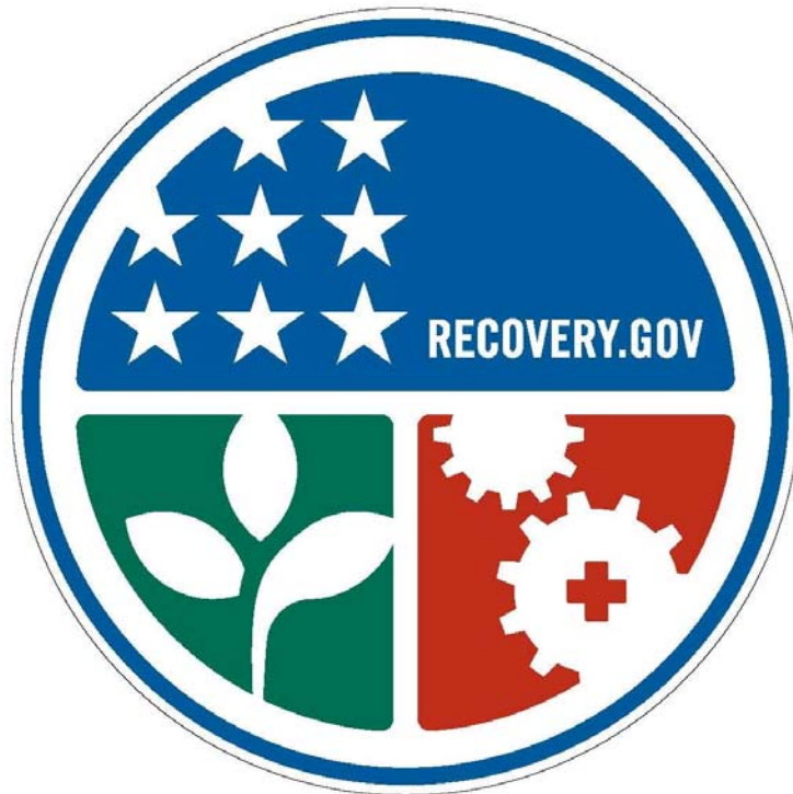
RECOVERY Vector-Based, Vinyl-Ready Pictograph