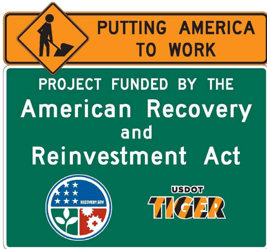
PROJECT FUNDING SOURCE SIGN ASSEMBLY