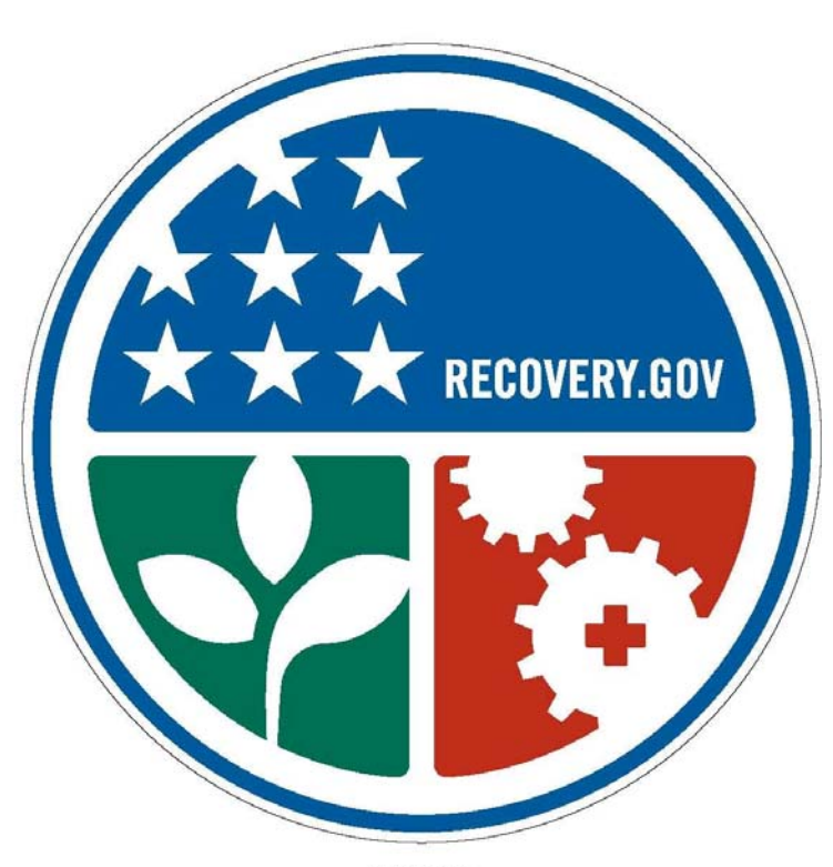
RECOVERY Vector-Based, Vinyl-Ready Pictograph