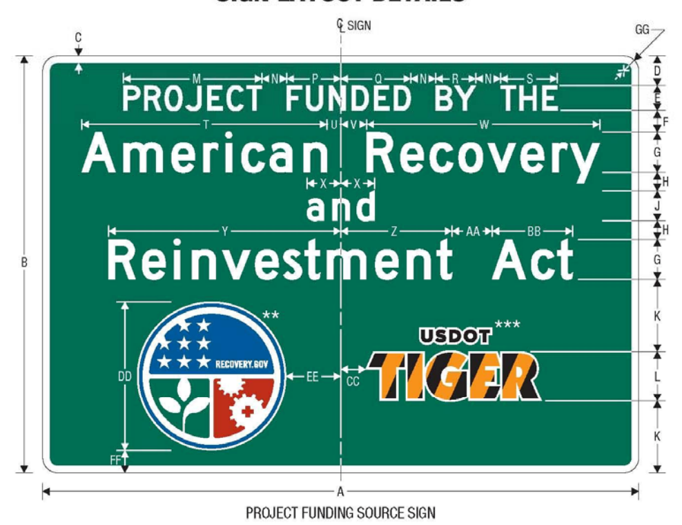
NOTE: SIGN SHALL NOT BE INSTALLED WITHOUT PROJECT FUNDING SOURCE PLAQUE