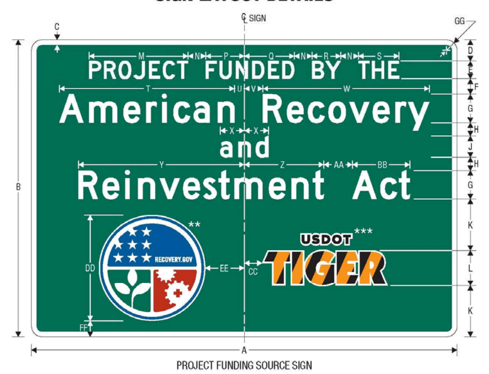
NOTE: SIGN SHALL NOT BE INSTALLED WITHOUT PROJECT FUNDING SOURCE PLAQUE