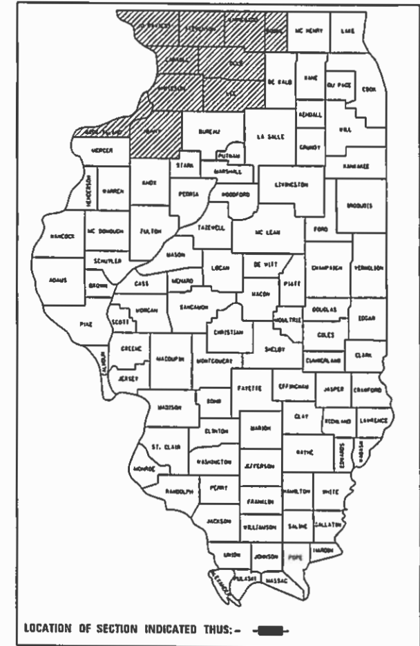
LOCATION OF SECTION INDICATED THIS: -

J.U.L.I.E. JOINT UTILITY LOCATION INFORMATION FOR EXCAVATION 1-800-892-0123