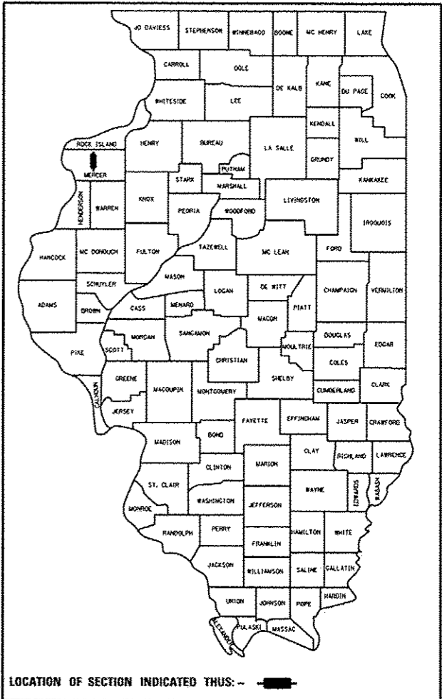
LOCATION OF SECTION INDICATED THUS: -