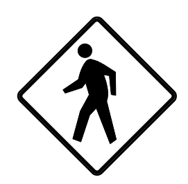
W11-2 30" × 30" 6.3 SQ. FT. SIGN PANEL - TYPE 1

RS PANEL - FLUORESCENT GREEN (RETROREFLECTIVE PANEL) 2" × 84" 1.2 SQ. FT. SIGN PANEL - TYPE 1