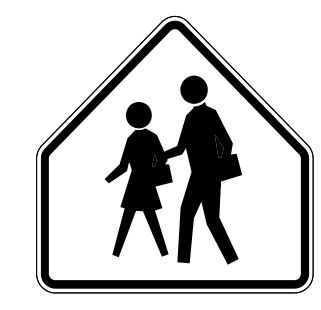
S1-1 36" × 36" 9.0 SQ. FT. SIGN PANEL - TYPE 1