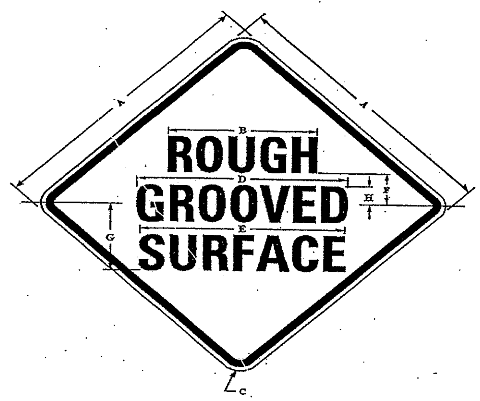
COLOR: LEGEND AND BORDER — BLACK NON-REFLECTORIZED BACKGROUND — ORANGE REFLECTORIZED