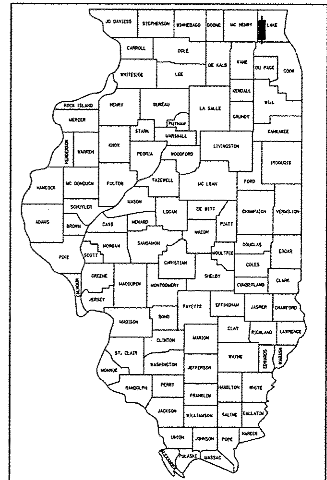
LOCATION OF SECTION INDICATED THUS: - [shaded area] -