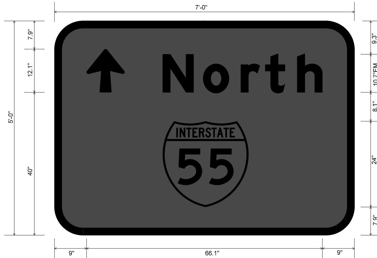
8.0" Radius 2" TH, Panel Style: guide_exp_supplemental.ssi M.U.T.C.D.: 2009 Edition