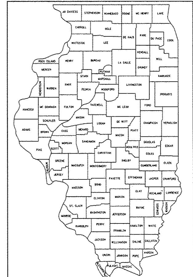
LOCATION OF SECTION: VARIOUS LOCATIONS IN MADISON, BOND, ST. CLAIR, MONROE, CLINTON AND WASHINGTON COUNTIES.