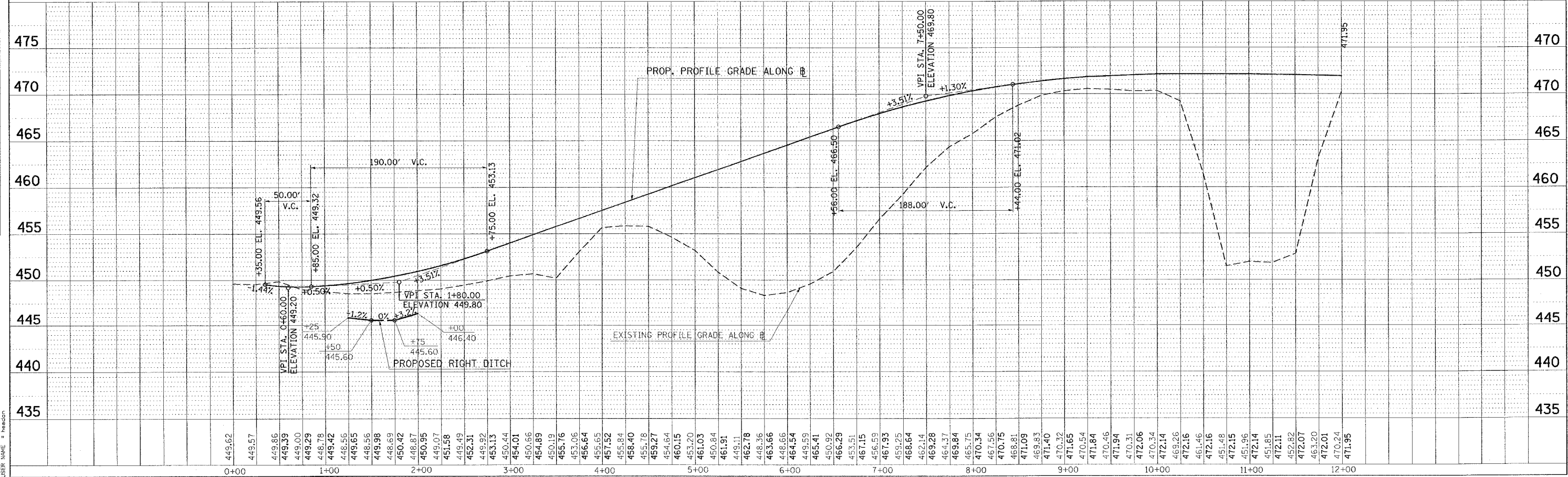
EROSION CONTROL STA. 0+00 TO STA. 12+00 RAMP "FF"

PLOT DATE = 11/21/2006 FILE NAME = c:\projects\98950\102802\erod\102802.dgn SCALE = 1/8" = 1'-0" USER NAME = jfreder