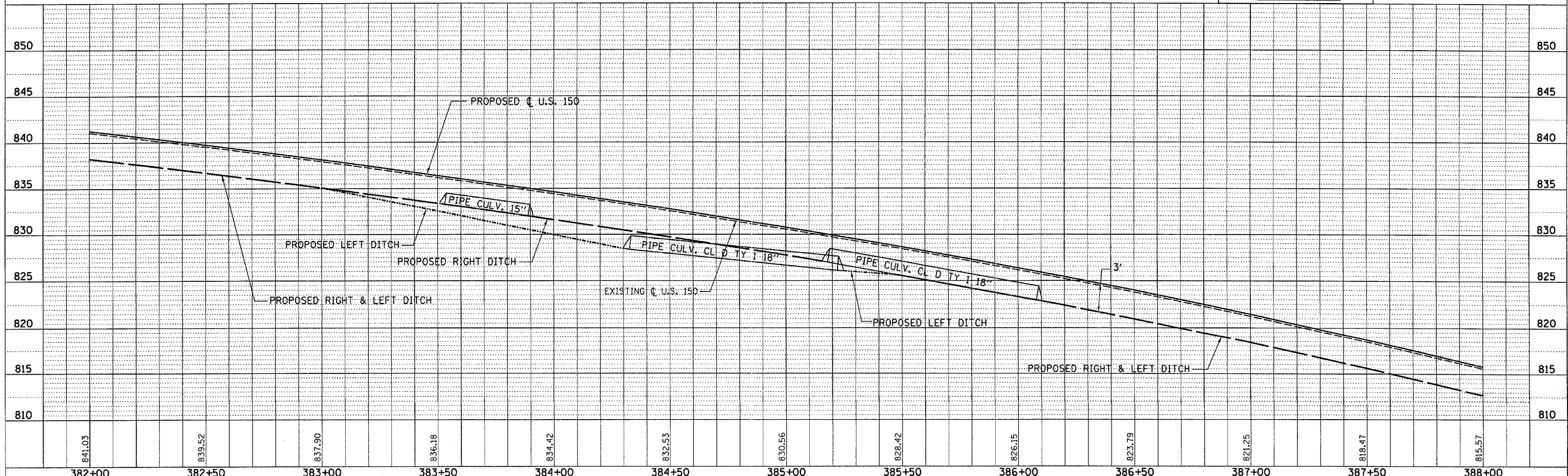
STA. 382+00 TO STA. 388+00 PLAN & PROFILE