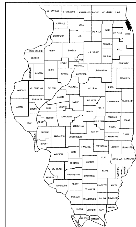
LOCATION OF SECTION INDICATED THUS: -