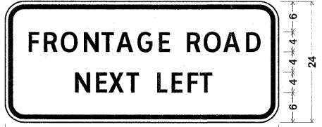
NORTH BOUND ARSENAL RD - STA 964+38 GROUND MOUNT

3.75" Radius, 0.88" Border, 0.63" Indent, White on Green; [FRONTAGE ROAD] ClearviewHwy-3-W; [NEXT LEFT] ClearviewHwy-3-W;