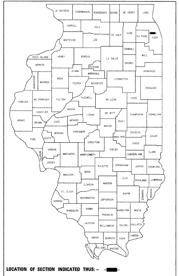
LOCATION OF SECTION INDICATED THUS: — ■ —

FOR INDEX OF SHEETS, SEE SHEET NO. 2 FOR LIST OF STANDARDS, SEE SHEET NO. 2