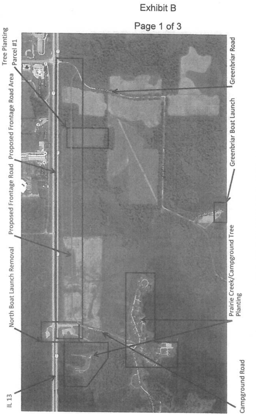
Frontage Road and Greenbriar Road Area