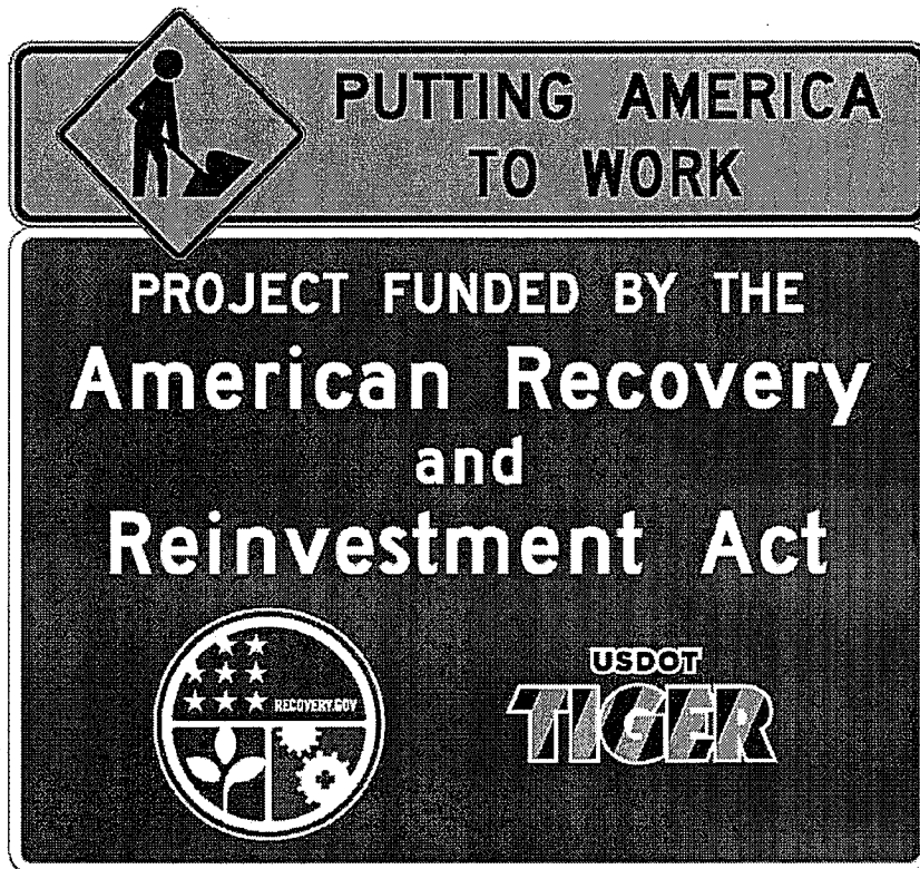
PROJECT FUNDING SOURCE SIGN ASSEMBLY