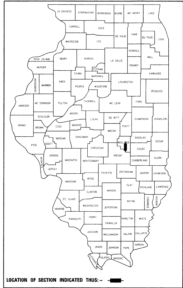
LOCATION OF SECTION INDICATED THIS: - [black rectangle]