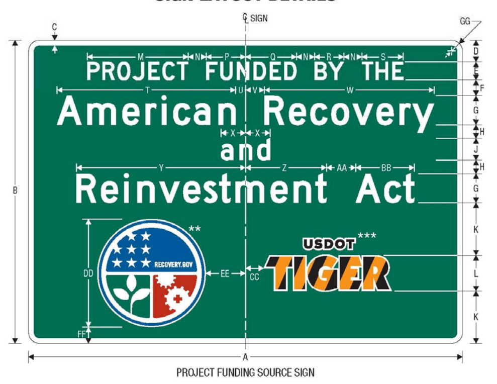
NOTE: SIGN SHALL NOT BE INSTALLED WITHOUT PROJECT FUNDING SOURCE PLAQUE