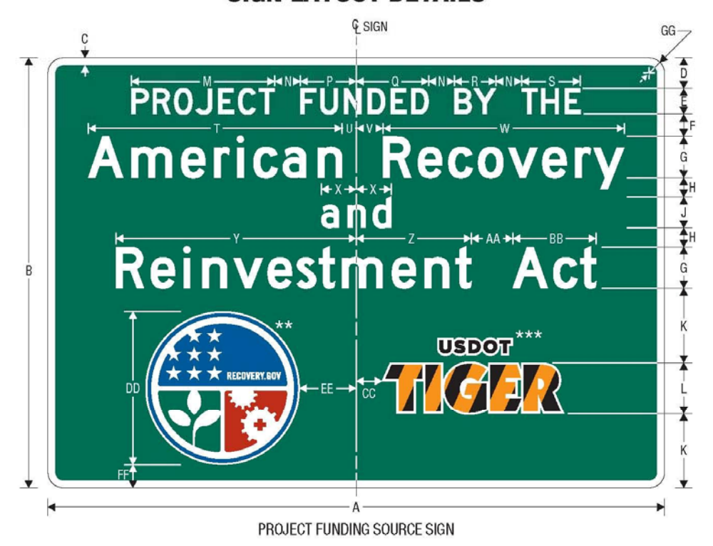
NOTE: SIGN SHALL NOT BE INSTALLED WITHOUT PROJECT FUNDING SOURCE PLAQUE