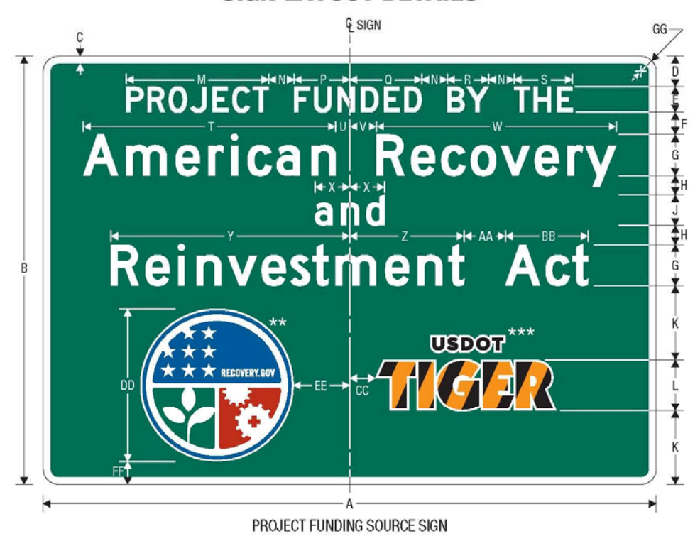
NOTE: SIGN SHALL NOT BE INSTALLED WITHOUT PROJECT FUNDING SOURCE PLAQUE