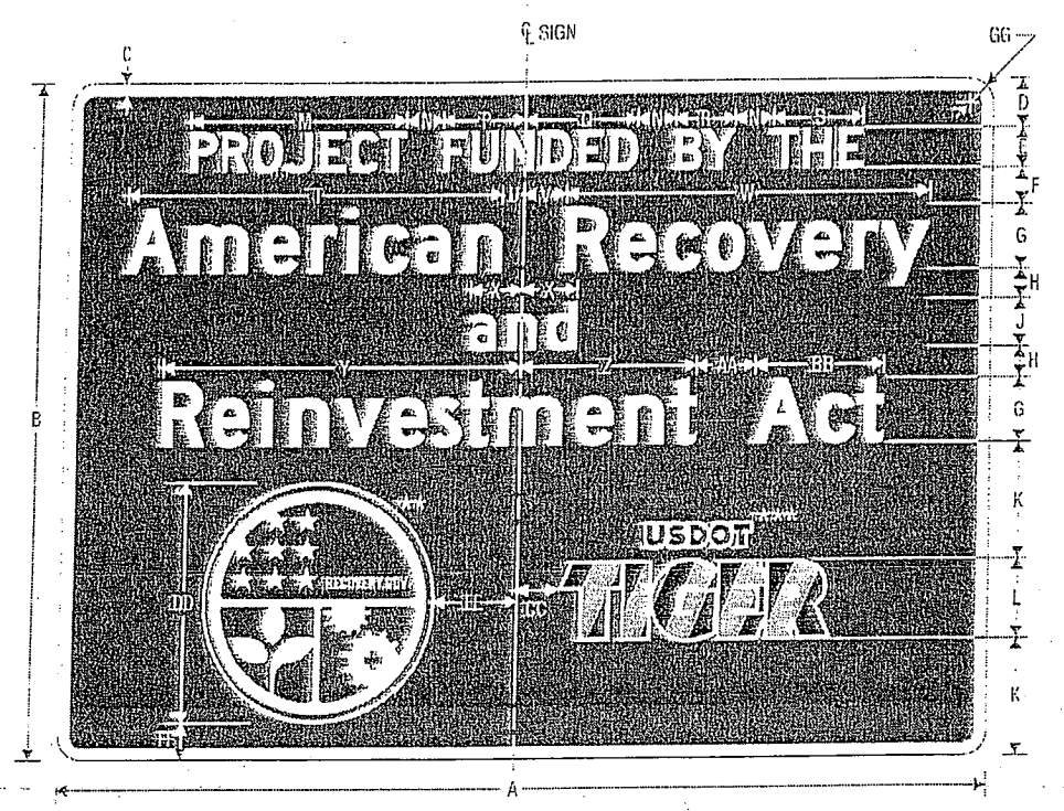
PROJECT FUNDING SOURCE SIGN

NOTE: SIGN SHALL NOT BE INSTALLED WITHOUT PROJECT FUNDING SOURCE PLAQUE