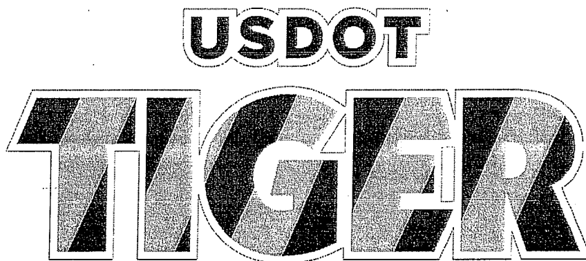
USDOT TIGER Vector-Based, Vinyl-Ready Pictograph

COLORS: OUTLINE - WHITE (RETROREFLECTIVE) USDOT LEGEND - BLACK TIGER DIAGONALS - BLACK, ORANGE (RETROREFLECTIVE)