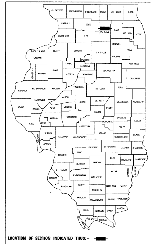
LOCATION OF SECTION INDICATED THIS: - [Black Box]