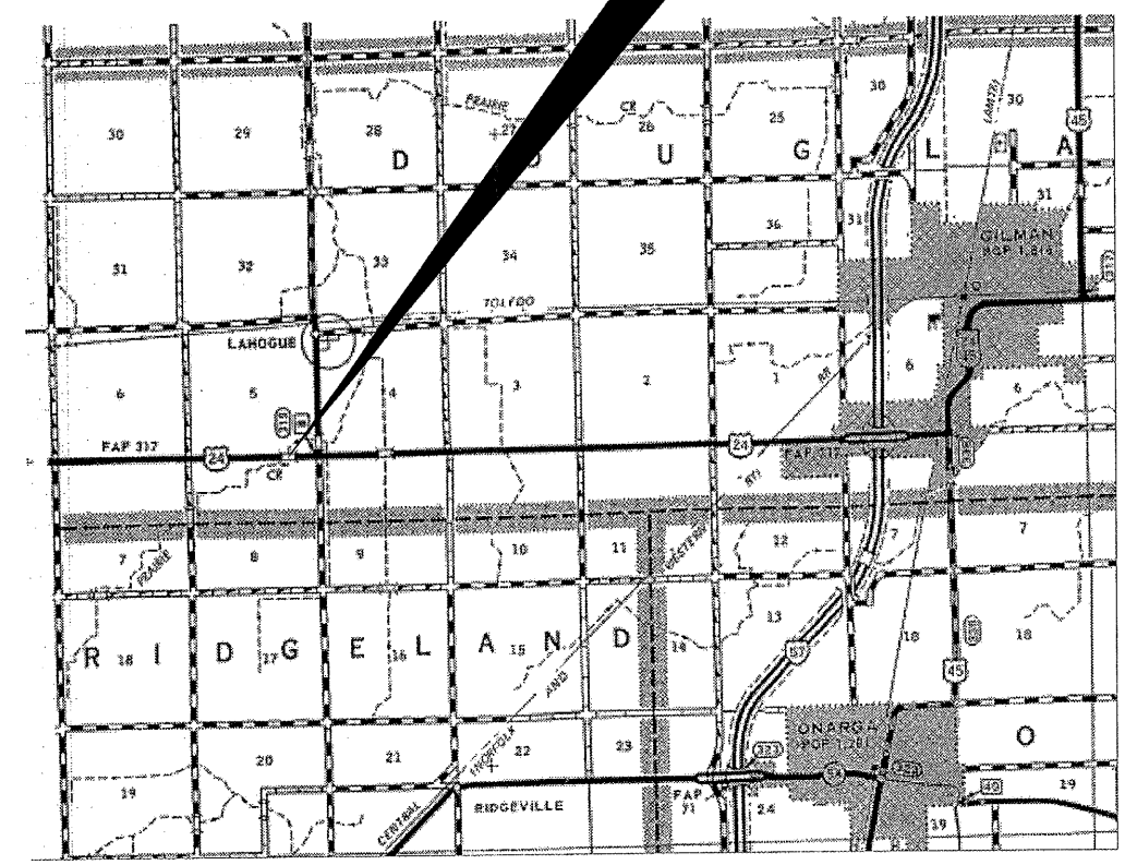
LOCATION MAP NOT TO SCALE POINT LOCATION

PRINTED BY THE AUTHORITY OF THE STATE OF ILLINOIS