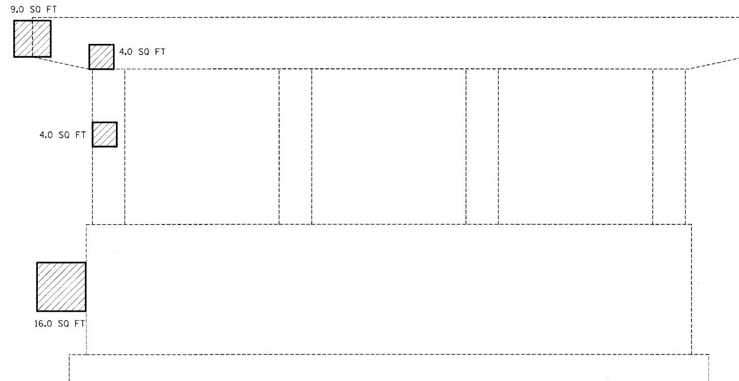
PIER #3 - WEST FACE

NOTE: QUANTITIES ARE ESTIMATED. ACTUAL QUANTITIES TO BE DETERMINED BY THE RESIDENT ENGINEER.