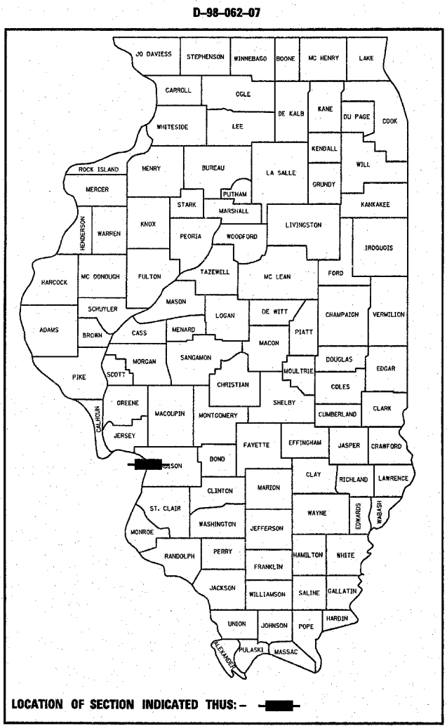
LOCATION OF SECTION INDICATED THUS: - [black rectangle] -

MADISON COUNTY INTERSTATE RESURFACING C-98-067-07