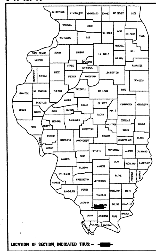
LOCATION OF SECTION INDICATED THUS: - [shaded box] -