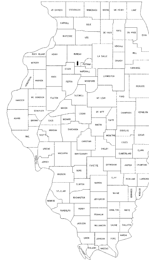
LOCATION OF SECTION INDICATED THUS: [Symbol]