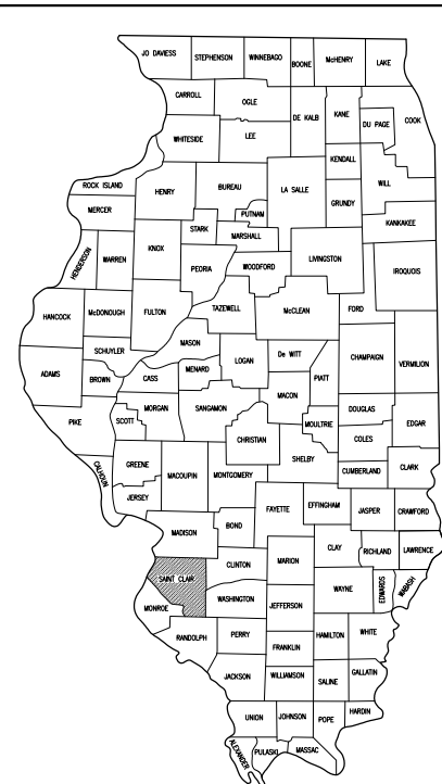
LOCATION OF COUNTY