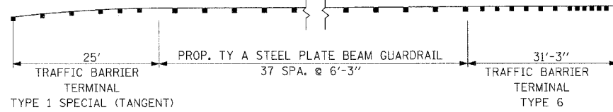
STEEL PLATE BEAM GUARDRAIL DETAIL EASTBOUND APPROACH TO BRIDGE