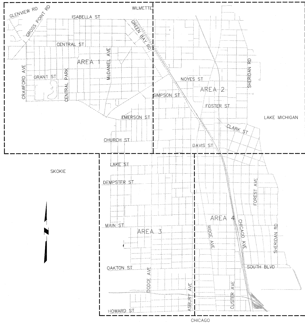
AREA KEY PLAN NOT TO SCALE