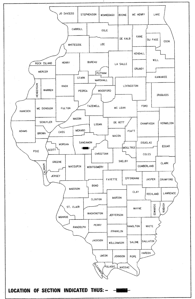
LOCATION OF SECTION INDICATED THIS: -