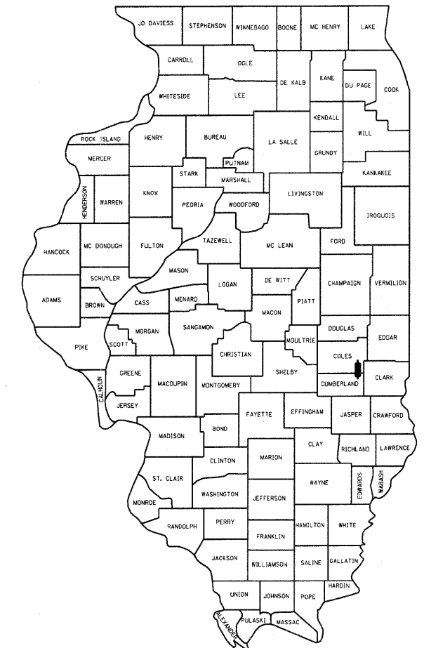
LOCATION OF SECTION INDICATED THUS: - [Black Box]

JOB NUMBER : C-97-046-12 SECTION NUMBER : 07-05136-00-BR PROJECT NUMBER : BROS-029(293)