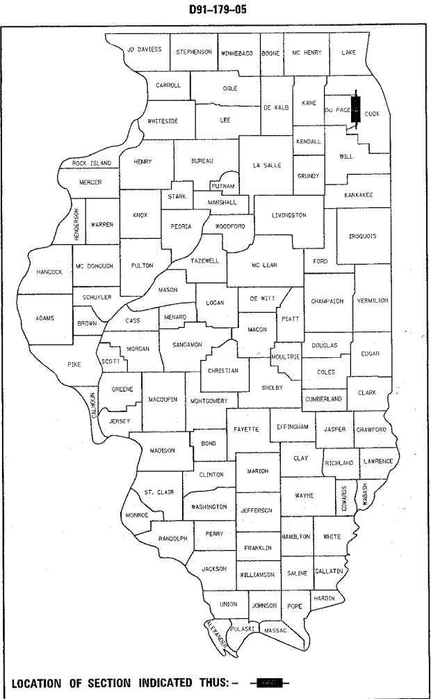
LOCATION OF SECTION INDICATED THUS: - [black rectangle] -

TRAFFIC DATA IL 83 SOUTH OF US 34 2003 ADT = 71,800 SPEED LIMIT = 40 MPH