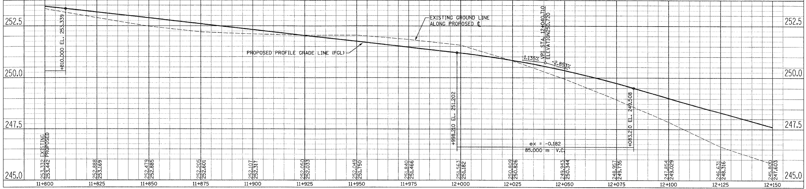
PLAN AND PROFILE IL RTE. 22 STA. 11+800 TO STA. 12+150