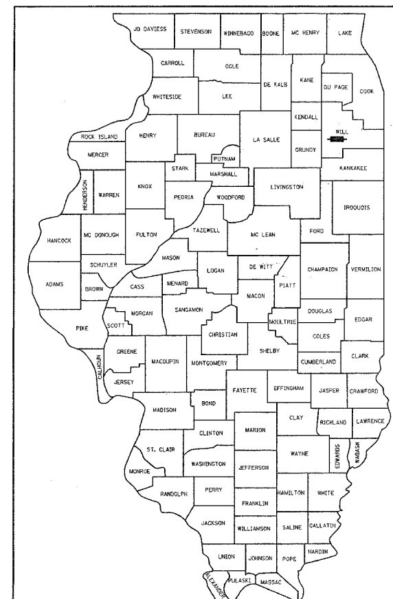
LOCATION OF SECTION INDICATED THUS: - [shaded box] -

IMPROVEMENT LOCATED IN THE CITY OF JOLIET