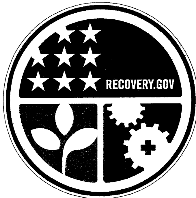
RECOVERY Vector-Based, Vinyl-Ready Pictograph

COLORS: LEGEND, OUTLINE — WHITE (RETROREFLECTIVE) BORDER — BLUE (RETROREFLECTIVE) BACKGROUND (UPPER) — BLUE (RETROREFLECTIVE) BACKGROUND (LOWER RIGHT) — RED (RETROREFLECTIVE) BACKGROUND (LOWER LEFT) — GREEN (RETROREFLECTIVE)