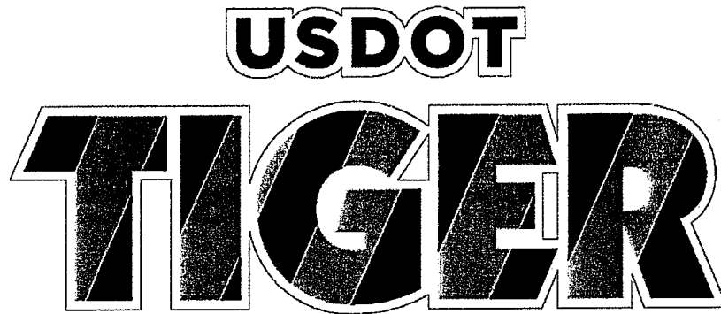
USDOT TIGER Vector-Based, Vinyl-Ready Pictograph

COLORS: OUTLINE — WHITE (RETROREFLECTIVE) USDOT LEGEND — BLACK TIGER DIAGONALS — BLACK, ORANGE (RETROREFLECTIVE)