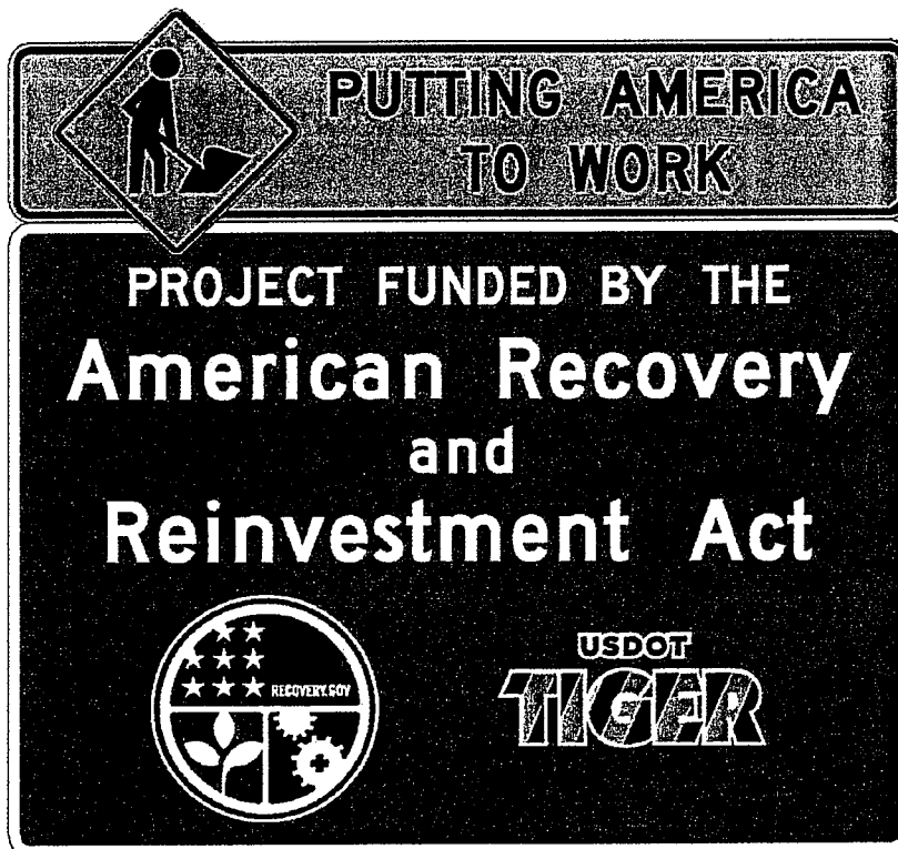
PROJECT FUNDING SOURCE SIGN ASSEMBLY