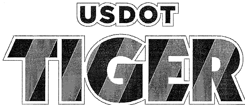
USDOT TIGER Vector-Based, Vinyl-Ready Pictograph

COLORS: OUTLINE — WHITE (RETROREFLECTIVE) USDOT LEGEND — BLACK TIGER DIAGONALS — BLACK, ORANGE (RETROREFLECTIVE)